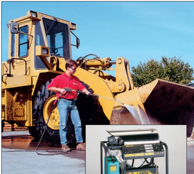
The SEHW is a top-of-the-line model for hot water pressure washing outdoors